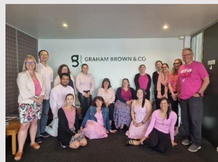
Graham Brown & Co went Pink for a day