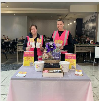
Annual Appeal Chartwell Shopping Centre

A touch of pink makes all the difference in raising awareness and FUNDS for breast cancer. We share some of the highlights of how 2023 was PINKAFIED