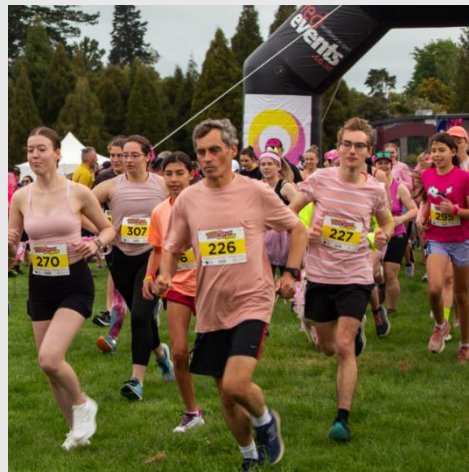
Pink Walk & Run Hamilton