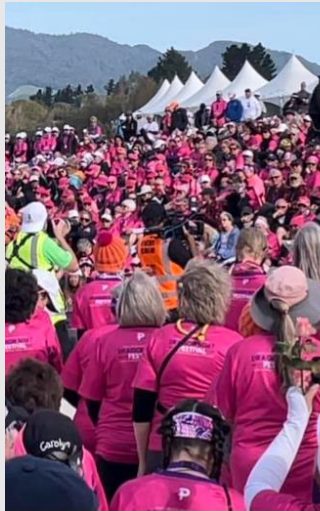
IBCPC Dragon Boat Festival