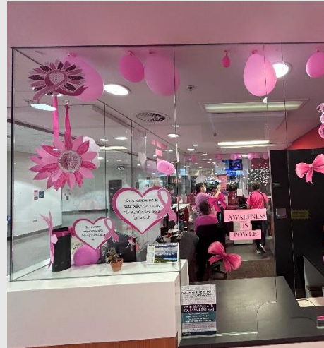
Meade Clinical Centre Reception B