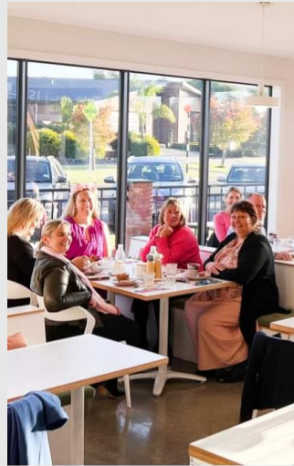
Kaz Design Pink Breakfast