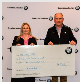
Coombes Johnston BMW Golf Day