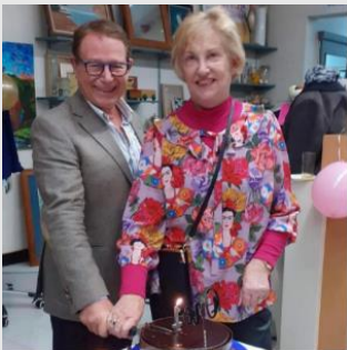
The Op Shop for Breast Cancer first birthday